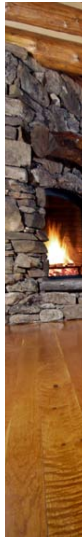
Mountain retreat. Carlisle Country Grade Cherry -