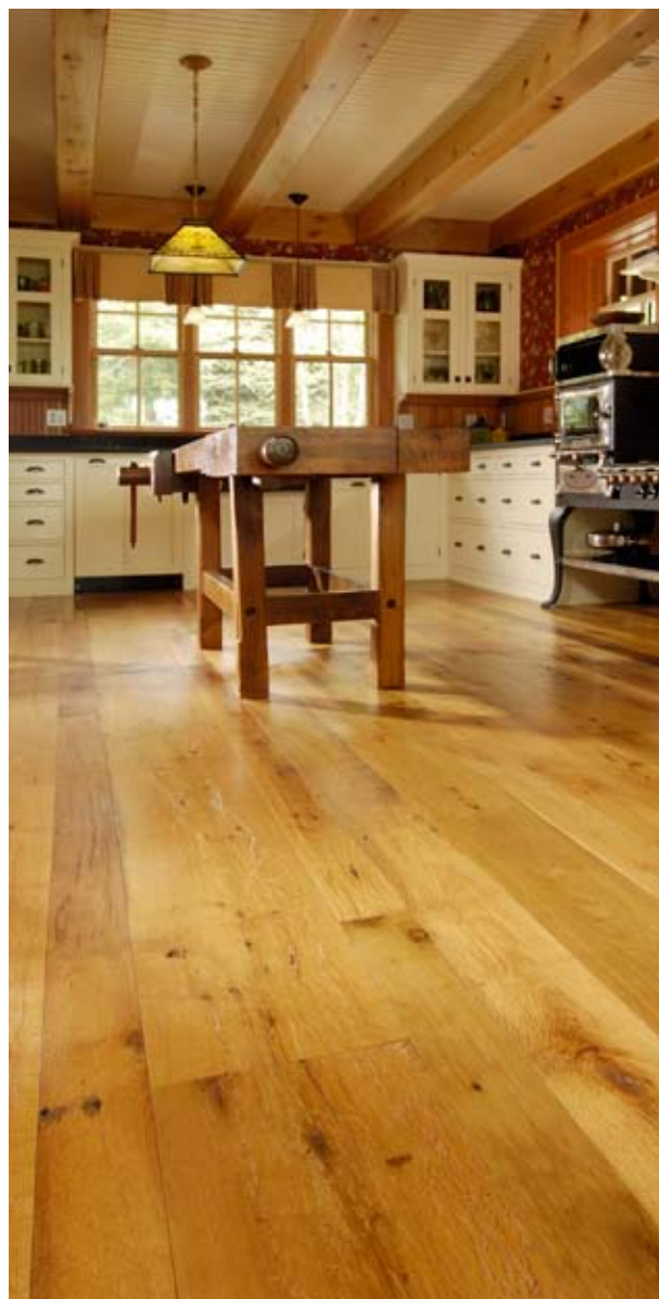
FSC Certified Carlisle Antique Oak—Moultonborough, NH.